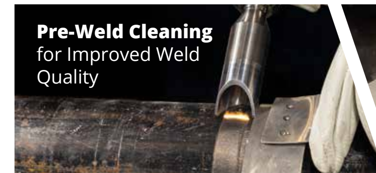
Pre-Weld Cleaning for Improved Weld Quality

LightWELD XR easily welds steel, stainless steel, aluminum, titanium, copper, and nickel alloys without part deformation. Preset modes ensure proper laser settings for consistent high-quality welds. Built-in wobble function accommodates wider seams, while wire welding capability extends welding application to poorly fit up parts.