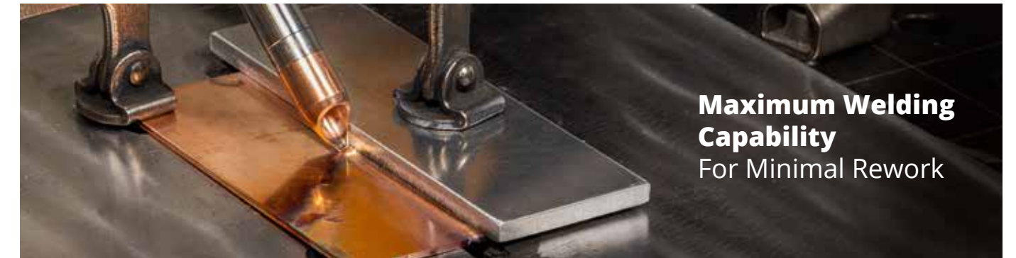
Maximum Welding Capability For Minimal Rework

LightWELD built-in optimized presets provide high-quality, consistent welds for any skill level. LightWELD XC and LightWELD XR offer the added functionality of pre- and post-weld cleaning. Pre-weld cleaning removes oil, grease, paint, or any potential contaminants that can affect weld quality. Post-weld cleaning creates visually appealing welds while eliminating need for post processing