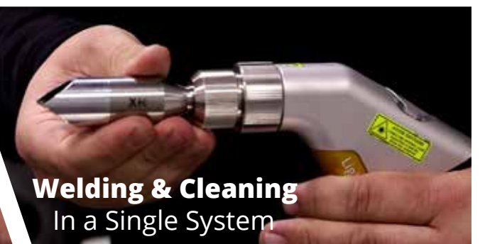
Welding & Cleaning In a Single System

Switching between welding and cleaning is fast and easy. Simply loosen the collet, insert the welding or cleaning nozzle, select a preset from the front panel, and the system is ready to clean or weld.