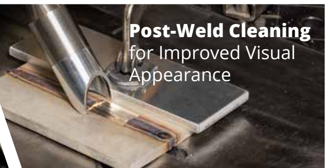
Post-Weld Cleaning for Improved Visual Appearance

LightWELD is powerful enough to melt metal and create a weld pool even if contaminants are present. However, to improve weld quality and reduce porosity, best results are attained by pre-cleaning to remove any oil, grease, or any debris that could enter the weld pool and create a defect.